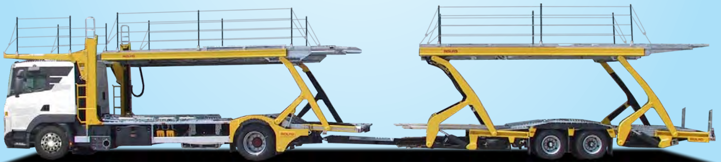
NEW TRUCK WITH RECONDITIONED BODY AND TRAILER