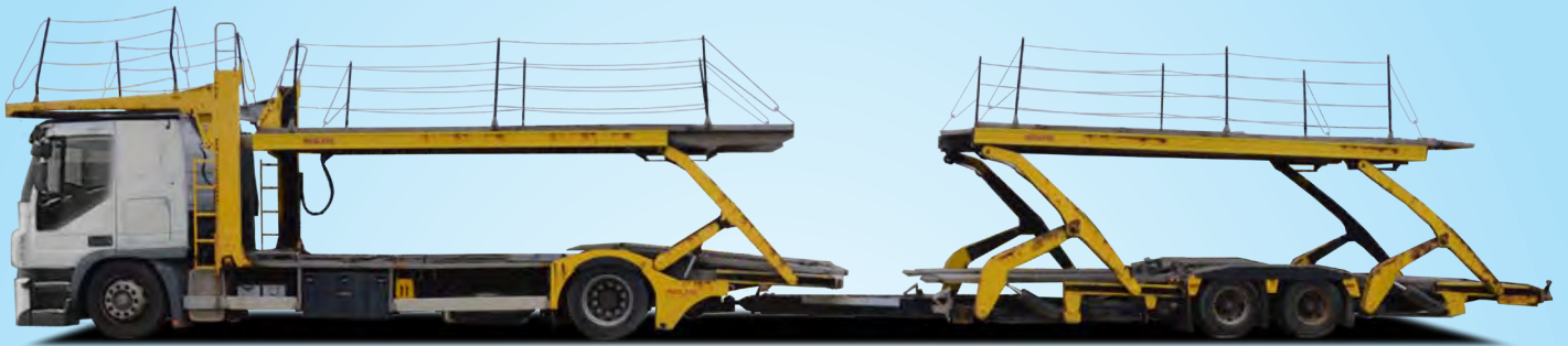
USED TRUCK AND TRAILER